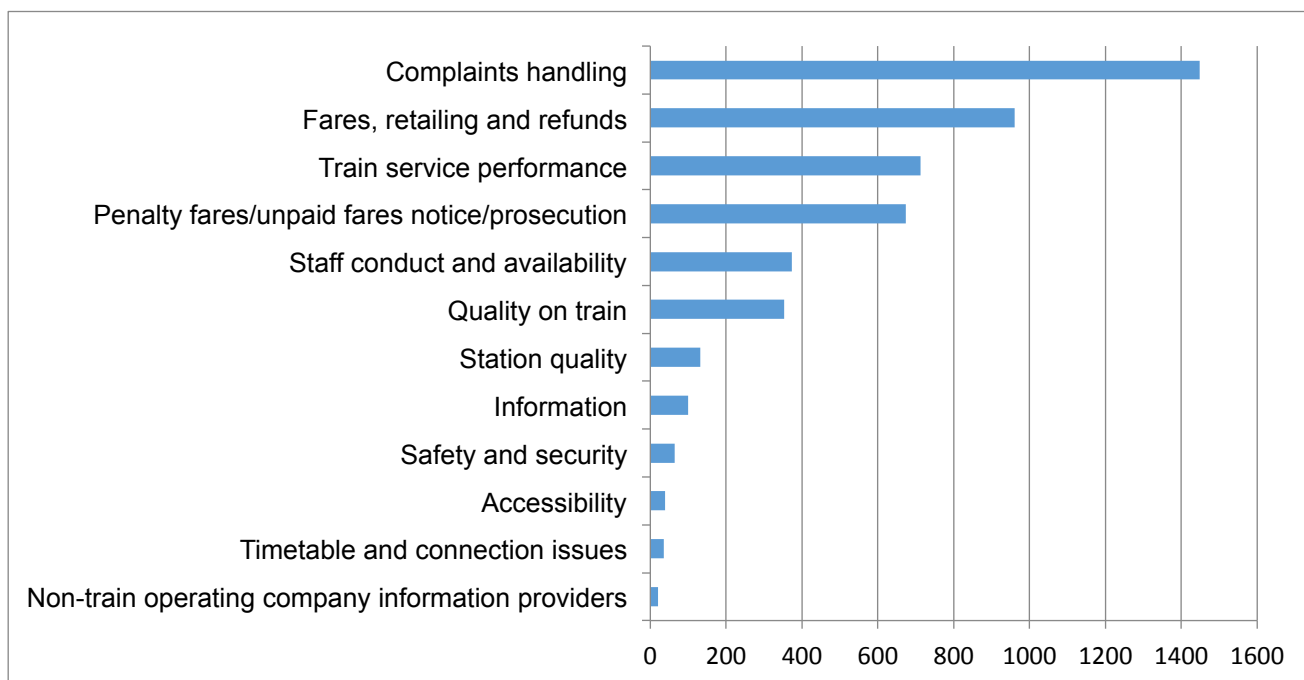
Fig 1. Appeal complaints by reason (all resolved cases)

Please note: Fig 1 totals add up to a greater number than Table 1. This is because a single appeal complaint may have several aspects.